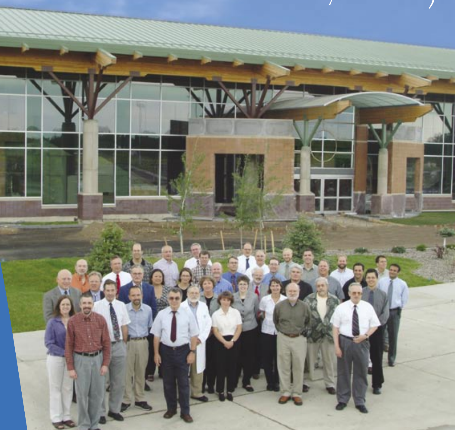
39 of our over 600 physicians and employees shown here in front of our new Specialty Center. Over 32 physicians will have offices here.

It is an honor for the Great Falls Clinic to offer to our community and region the services that will be provided in the new Great Falls Clinic Specialty Center. The Great Falls Clinic remains committed to the delivery of high quality healthcare. The team concept in delivering care allows our providers to achieve that goal. That is a benefit to our patients!